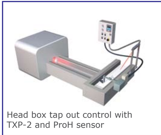
Head box tap out control with TXP-2 and ProH sensor

This small and compact Tap Out Actuator is primarily used for control of metal flow through a pin plug valve in head box applications.