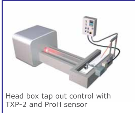
Head box tap out control with TXP-2 and ProH sensor

This small and compact Tap Out Actuator is primarily used for control of metal flow through a pin plug valve in head box applications.